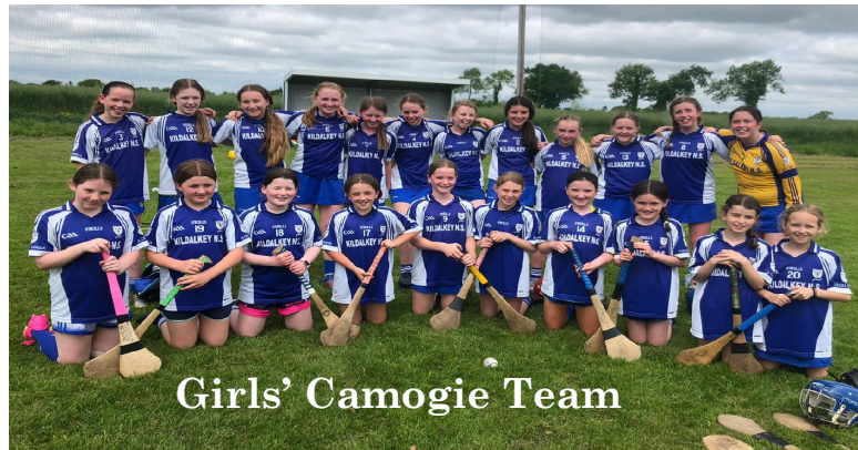
Girls' Camogie Team